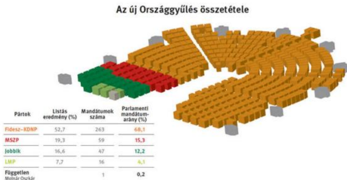
Figure 2: Composition of the Hungarian Parliament 2010

Hungary's 1990 election law gave disproportionate numbers of seats to the winner of an election, a feature that was designed to help plurality parties form stable governments. When Fidesz got 53% of the vote in the 2010 election, the election law converted this victory into 68% of the seats in the Parliament. While Fidesz won this vote in a joint party list with the Christian Democrats (the KDNP), the Christian Democrats barely have an independent existence apart from Fidesz and its members vote in a bloc with Fidesz on every issue.